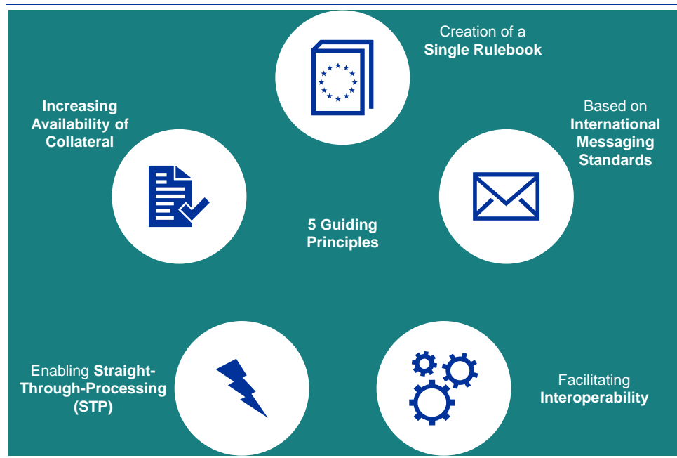
Figure 1 Guiding principles

Principle 1: Harmonisation should lead to a single pan-European collateral management rulebook for interaction between FMIs and their users, including central banks. In the past, FMIs were free to impose local market practice rules to suit their business or local needs, with specific business processes and messaging. In a pan-European context, this leads to significant heterogeneity. Harmonisation should establish pan-European practices and rules for interaction between FMIs and their users (including central banks) to promote the safe and effective management of collateral relevant for processes related to market transactions and Eurosystem credit operations, involving triparty and bilateral collateral management arrangements.